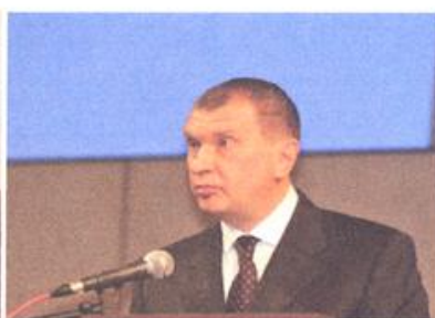
Игорь Сечин, Заместитель Председателя Правительства РФ Выступление на Главной сессии «МЭН.2009»

In the development of the Forum a lot of attention paid to the preparation and implementation of bilateral and multilateral business meetings between Russian and foreign businesses, research institutions and government authorities. Over the years, business meetings were held foreign dignitaries and organizers of the forum with State Duma and the Federation Council of the Federal Assembly of the Russian Federation, Deputy Prime Minister and Minister of Foreign Affairs, the Minister of Natural Resources of the Russian Federation, the Minister of Energy of the Russian Federation.