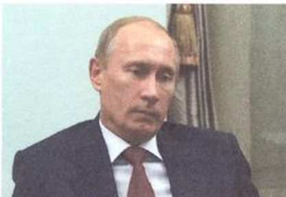
Встреча В.В. Путина, Президента Российской Федерации и Киюо Акино, чиральниги секретари МАГАТЭ в рамках 10той Международной Энергетической Неделе

Permanent participants of the International Energy Week: Regular participants of the International Energy Week: the heads of the producing countries (OPEC), the International Energy Agency (IEA), the IAEA, the Nuclear Energy Agency (NEA), the International Energy Forum (IEF), the Gas Exporting Countries Forum, the EU Commission on Energy, EvrAzES, SCO, International Gas Union and other organizations. Energy industry leaders from more than 40 countries annually take part in the Forum.