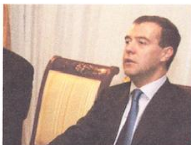
Дмитрий Медведев, Президент РФ На переговорах с Генеральным секретарем ОП «МЭН.2008»